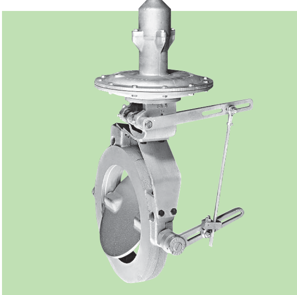
1146 or 1156 Motorized Wafer Valve