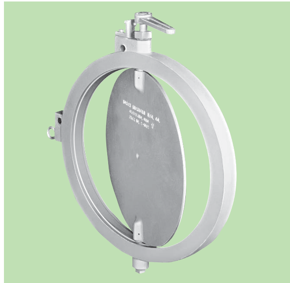
1145 or 1155 Manual Wafer Valve

North American Wafer Butterfly Valves are rugged, lightweight, and used for controlling low pressure air or gas flow. They sandwich between companion flanges with two locating holes on the valve body. All wafer valves have stainless steel shafts; bodies and discs are heat-resistant cast iron. All are suitable for inlet pressures up to 25 psig, provided differential pressures across valves are limited to 1 psi for 1145 and 1146 Valves, 2 psi for all others. No lubrication is required. Seven types are available.